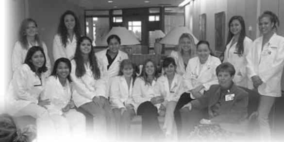
Students in the Emerging Health Professionals program attend college-level science classes at Penn State Lehigh Valley two days a week, and visit Lehigh Valley Hospital and Health Network three days a week.