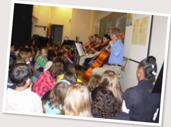
SATORI performing for students at Governor Wolf Elementary School in Bethlehem

SATORI, Ltd. presents formal concerts of traditional and contemporary chamber music at locations throughout the greater Lehigh Valley. Concerts are often scheduled away from the typical concert hall venue, and are presented in a “listener-friendly” atmosphere. Support from The Rider-Pool Foundation is used for the ongoing public chamber music concert series, in-school educational programming, the Gift of Music instrument donation program, the annual student competition and community outreach concert series for seniors, the disabled, and hospice patients.