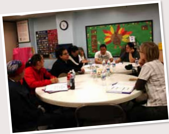
"Parents Who Care" parenting education and family wellness group