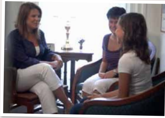
Some sessions at Family Answers