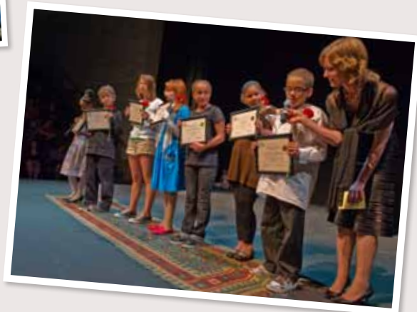
Award recipients at Young Playwright's Festival

As a professional, not-for-profit ensemble theatre company, Touchstone's mission is dedicated to being an active force in the renewal of theatre as a vital art form. Now in its fifth year, The Young Playwrights' Lab is a school-based arts-in-education student residency program for local youth. This program was developed by Touchstone Theatre teaching artists in collaboration with the Bethlehem Area School District to improve attitudes towards literacy and achievement in academic standards, provide tools to enhance communication skills and promote positive methods for conflict resolution.