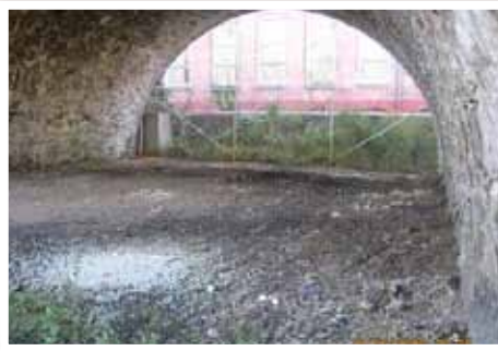
Linden bridge after