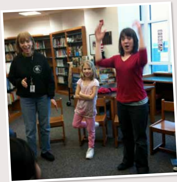
Participants enjoying The Young Playwrights' Lab program