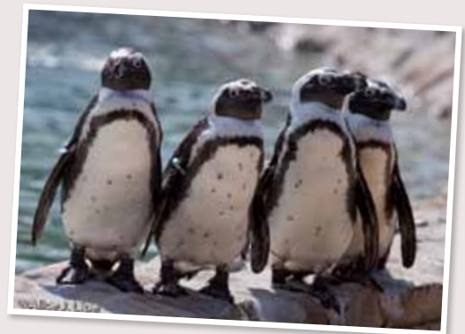
African Penguins located in the Jaiendl Penguin Pavilion at the LV Zoo

The Rider-Pool Foundation provided support to modernize Lehigh Valley Zoo's veterinary clinic, allowing the Zoo to make further strides in education, science and conservation through the expansion of its exotic animal collection.