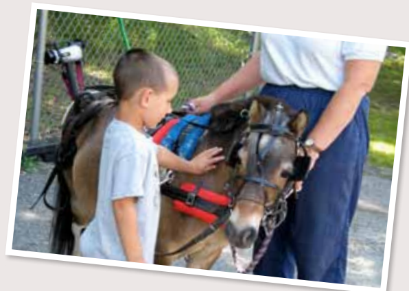
Little Bear, a miniature horse, and one of the children getting to know each other

Equi-librium offers horse-related activities for children and adults with special needs. These specialized activities use a combination of sport, education, therapy, recreation and leisure. They strive to improve an individual's behavior, communication, physical, perceptual and social skills, as well as balance, muscle tone, self-esteem, independence, communication skills, relationship building and attention to task ... all skills that lead to greater independence.