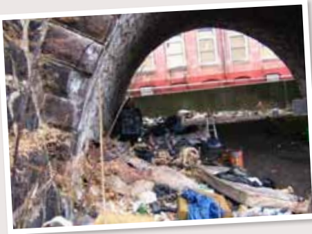
Linden bridge before

The Lehigh County Conference of Churches (LCCC) operates a Continuum of Care Program, providing a venue for the street homeless. LCCC's Continuum of Care approach is an effective best-practices model with the goals of walking the street homeless into permanent housing and sustaining them in that housing, saving lives and conserving valuable community resources. The following is an account of the program in action, both in word and pictures: "When the Linden Street Bridge in Allentown was to be rebuilt, nine guys were living in an encampment underneath. Our Homeless Supportive Services program reached out, brought them into case management, worked with several of our programs and others in the community to get them benefits and services, and eventually 8 of the 9 were placed successfully in permanent housing. One of the guys insisted on cleaning up the area before he left. We convinced the City to supply an industrial dumpster, gloves and tools. Before he left, he filled the dumpster twice and left the place as you see in the picture."