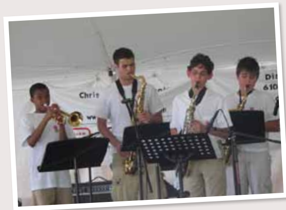
CMS students participate at Mayfair 2010

Community Music School (CMS) offers quality music instruction to all members of the community in most all instruments and voice. Outreach programs that teach those most academically at-risk or those with physical/mental challenges are part of the CMS mission. CMS has touched 10,000 members of the community through the study of music. Support from The Rider-Pool Foundation allows youngsters without the financial means to study with professionals. Students benefit from the opportunities that come along with music instruction, including building self-esteem, self-confidence and discipline.