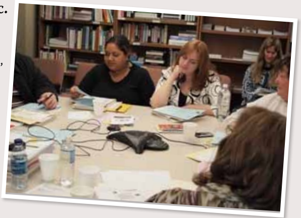
A webinar training session

The Arc provides resources, individualized advocacy and specialized training on intellectual and developmental disabilities to the people of Lehigh Valley. In a four-year period, The Arc completed more than 57 different training sessions and trained more than 1,150 individuals, including children and adults with intellectual and developmental disabilities, their families and professionals who serve this population. In an effort to make the specialized training sessions more accessible, The Arc utilized resources provided by The Rider-Pool Foundation to develop the option of attending and participating remotely via the internet, as a webinar session. The Arc now archives past training sessions on their website, which can be accessed at anytime.